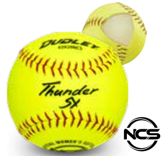
THUNDER SY™ Item# 43920NCS