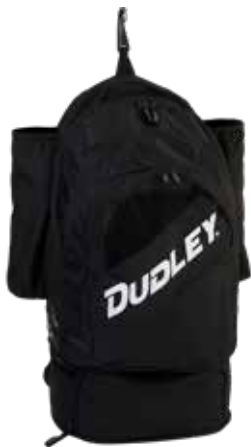
Pro Softball Back Pack Item# 48077