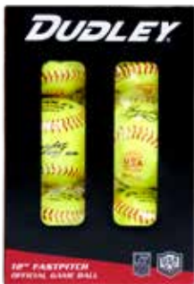
THUNDER HEAT® Item# 4D147YR6