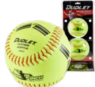
12" PITCHER'S TRAINING KIT Item# 4FPPT12R