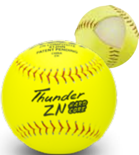
THUNDER ZN HARD CORE™ Item# 412HN