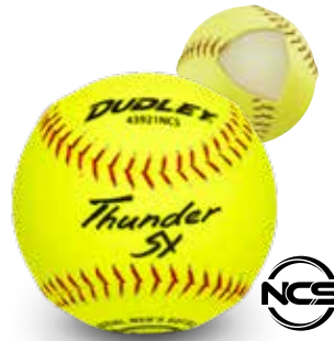
THUNDER SY™ Item# 43921NCS