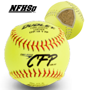
CFP™ Item# 43873