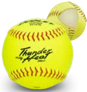
THUNDER HEAT® Item# 43147N