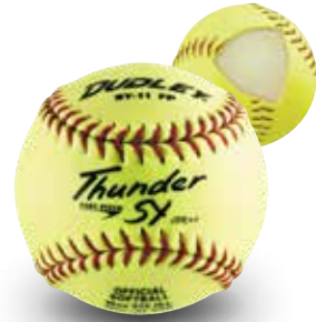
THUNDER SY™ Item# 43712Y