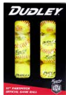
THUNDER HEAT® Item# 4A144R6