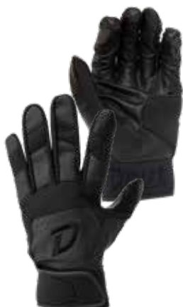
Dudley® Batting Glove