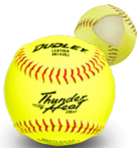
THUNDER HEAT® Item# 4N143NJ