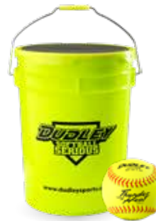
BUCKET OF NFHS BALLS (43147 - Thunder Heat®) Item# 4D48051