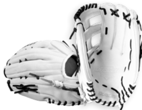
FIELDERS GLOVE H WEB WHITE 14" Item# DFG14H