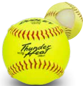
THUNDER HEAT® Item# 43531N