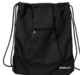
Dudley® Drawstring Bag Item# 48073