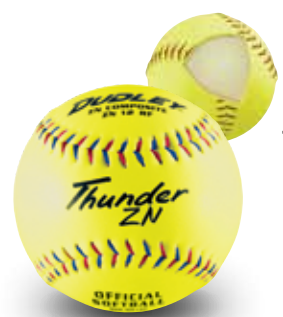
THUNDER ZN® Item# 43055