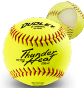
THUNDER HEAT® Item# 43068Y