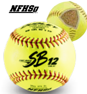
SB12™ Item# 4H311Y