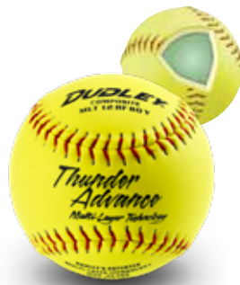
THUNDER ADVANCE™ Item# 43184Y