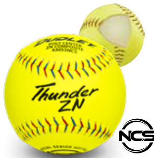
THUNDER ZN® Item# 43055NCS