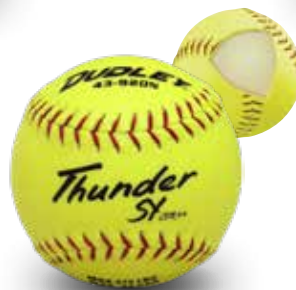
THUNDER SY™ Item# 43920N