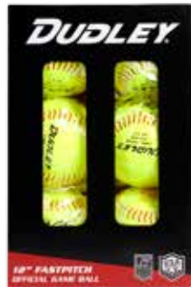
SB12™ Item# 4D311YR6