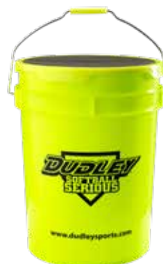
Softball Bucket with Padded Lid Item# 48010