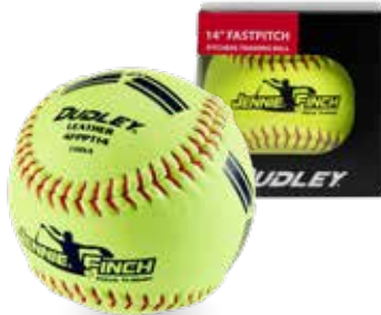
14" OVERSIZED TRAINING BALL Item# 4FPPT14