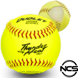
THUNDER HEAT® Item# 43147NCS