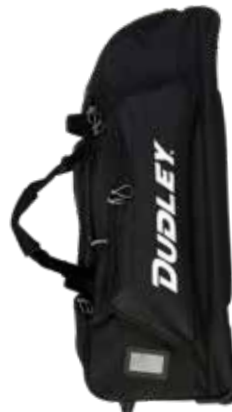
XXL Pro Softball Player Bag on Wheels Item# 48075