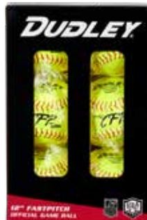
CFP™ Item# 4D865R6