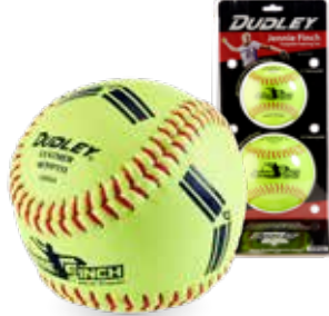
11" PITCHER'S TRAINING KIT Item# 4FPPT11R