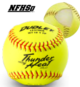
THUNDER HEAT® Item# 43147