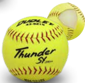
THUNDER SY™ Item# 43921N