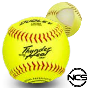
THUNDER HEAT® Item# 43531NCS