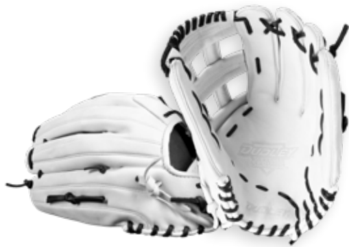
FIELDERS GLOVE H WEB WHITE 13" Item# DFG13H