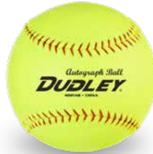
DUDLEY® TEAM AUTOGRAPH BALL Item# 4D21AB

TROPHY BALLS ARE NOT INTENDED TO BE STRUCK BY A BAT.