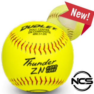
THUNDER ZN HARD CORE™ Item# 4NCS12H